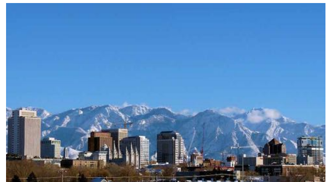
Salt Lake City

For religious reasons, Mormons are interested in genealogies – that is, family trees. In Salt Lake City there is a library with birth records from around the world. It's an interesting place for those who want to know more about their family history.