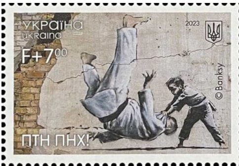
Ukraine's stamp showing a Banksy mural on a building destroyed by Russian artillery attacks: A small boy defeats Russian president Putin.

His satirical street art and mind-hurting pictures combine dark humour with graffiti. The graffiti is done with a stenciling technique. Such works have been done on streets, walls, and bridges of cities throughout the world.